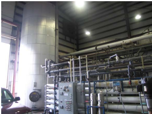
Ethanol Enzyme Tank & Distillation Tubes

Scenario 1: Exempt Scenario 2: Taxable Scenario 3: Taxable