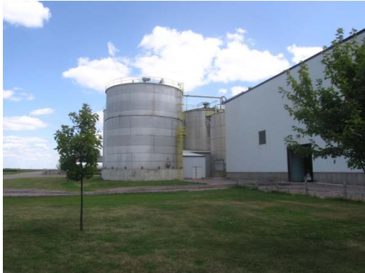
Ethanol Fermentation Tank

Scenario 1: Exempt Scenario 2: Taxable Scenario 3: Taxable