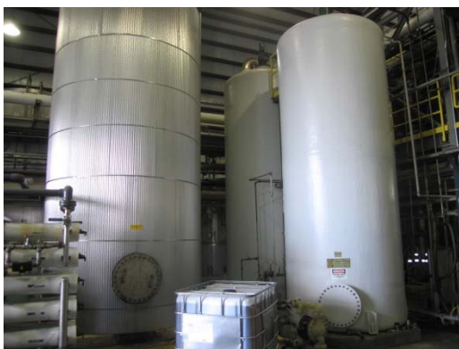
Ethanol Enzyme Tank & Liquefaction Tank

Scenario 1: Exempt (Both) Scenario 2: Taxable (Both) Scenario 3: Taxable (Tank) & Exempt (Tubes)