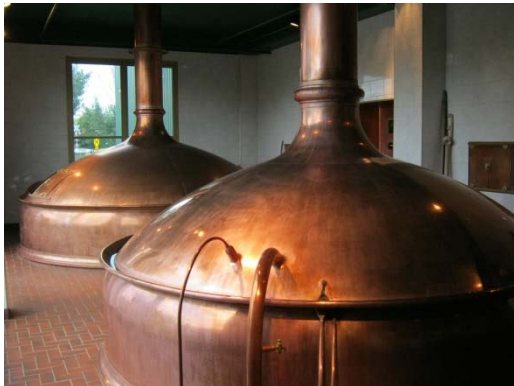
Beer Brewery Copper Brew Kettles