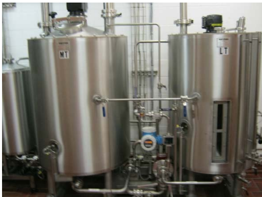
Beer Brewery Experimentation Tanks