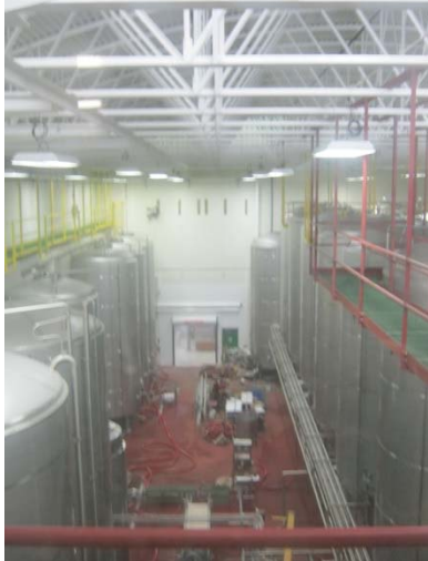
Beer Brewery Fermentation Tanks: